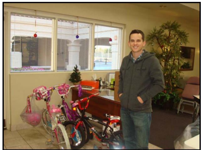
Head & Neck hidden word is: EYELASHES